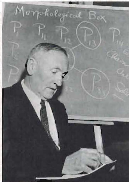
Fritz Zwicky (1898–1974) coined the term dunkle Materie (dark matter).

At this point, astronomers just assumed that a galaxy rotated much like our solar system, following the laws of gravity set down by Isaac