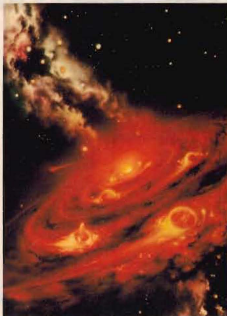
Galaxies separating: How fast are they going?