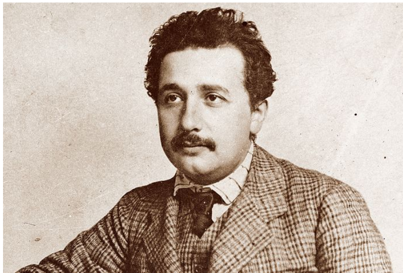
Albert Einstein at the Bern Patent Office, ca. 1905.

Albert Einstein is one of the most written-about figures of the 20th century, and for good reason. His theories upended the system that physicists had used to describe the world since Newton. Along the way, he became a figure of public fascination—a true celebrity. Now two books further scrutinize different aspects of the man.